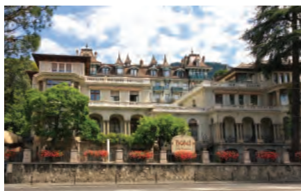
Villa Toscane, Montreux

This startling luxury hotel stands right on the banks of Lake Geneva. The Willow Stream Spa, the 3 restaurants and 4 bars, and the beautifully appointed rooms make this hotel a highly rewarding five star option for stays in Montreux. The Belle Epoque design reflects the building's history, while setting the tone for the sophistication and elegance that lies within.