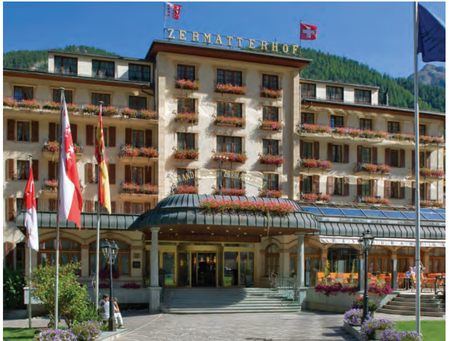
Grand Hotel Zermatterhof, Zermatt

A historic, chic property, the Grand Hotel Zermatterhof may well be the most prestigious hotel in Zermatt. Positioned in the centre of the village, it is just a minute's walk from the main church, a park, the best restaurants in Zermatt, and the Matter Vispa. The rooms blend state-of-the-art comfort with regal charm.