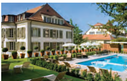
Hotel Angleterre et Residence, Lausanne

Housed within a late 19th century mansion, the Grand Hotel Villa Castagnola channels aspects of Mediterranean culture in its pale-peach façade, its summery garden, and the dining experiences on offer. Guestrooms have wholly unique touches to ensure that every stay here is different, and the swimming pool, lounges, and bars encourage guests to keep returning.