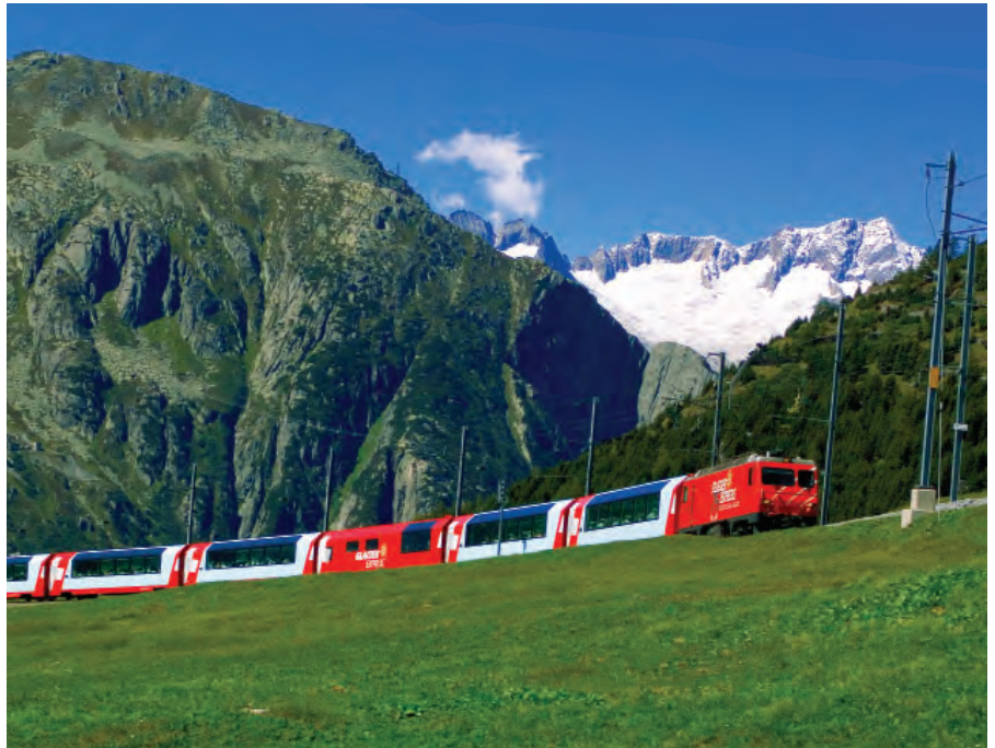
The Glacier Express

Small railways from Zermatt take you high up into the mountains, reaching 3000m above sea level, and the Glacier Paradise cable car transports you up to Europe's highest viewing platform. To extend both your experience of the railways of Valais and the mountains, take the Gornergratbahn up to the summit of the Gornergrat, from where you can bask in views of 38 mountain peaks. Consider visiting the Hornlihutte, where for decades climbers