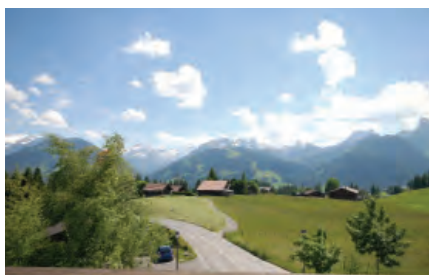
View from Hotel Alpenrose, Schoenried