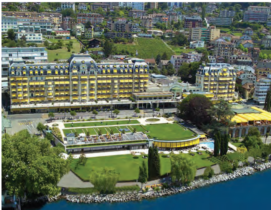
Fairmont le Montreux Palace, Montreux

Just a short walk from Gstaad's main boutiques, cafes, and restaurants, Le Grand Bellevue is a highly convenient hotel immersed in the picturesque lifestyle of the Saanenland. Its pale yellow façade is palatial in design, with a distinctive tower that shapes some of the hotel suites. Equipped with a Michelin starred restaurant and an indulgent spa, this is a luxurious property in which to spend two or three nights while you explore the Saanenland.