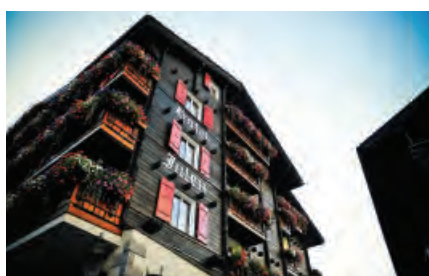
Romantik Hotel Julen, Zermatt