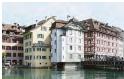
Hotel Wilden Mann, Lucerne

With easy access to both the Jungfrau and the Lauterbrunnen Valley, this chalet-style hotel offers a charming and homely four star option. A garden of trees and flowers leads you up to the front door, and inside, traditional Swiss decoration and design takes precedence. Guests here can also access the spa and dining facilities at the sister hotel, the Hotel Silberhorn.