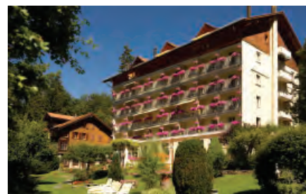
Hotel Wengener Hof, Wengen