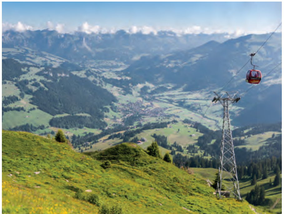
Rinderberg and Saanenland

In the late morning, board one of the panoramic coaches of the GoldenPass Line for the two hour journey from Schoenried to Montreux. After Gstaad, the GoldenPass Line crosses the border into Vaud, stopping first in Rougemont, and then Chateau-d'Oex. Here the mountainscapes are dotted with quaint chalets, small churches, and petit castles; an image that is very typical of the Pays-d'Enhaut. The villages you will pass next all retain their own individual architectural character, emerging out of plumes of evergreen trees. In Rossiniere and Montbovon, passengers can view the startling translucent