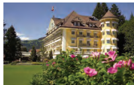
Le Grand Bellevue, Gstaad