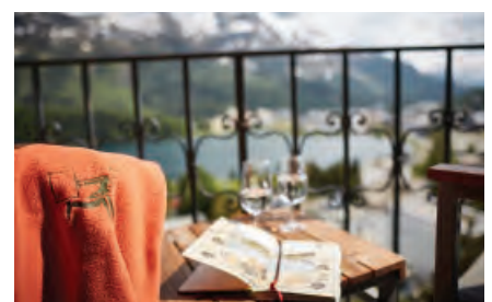
Hotel Schweizerhof, St Moritz