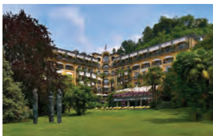
Grand Hotel Villa Castagnola, Lugano