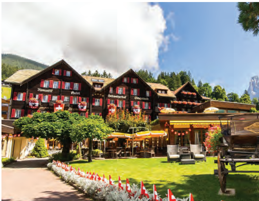
Romantik Hotel Schweizerhof, Grindelwald

This luxury hotel enjoys a central location on the lakefront close to the historic Old Town. The Schweizerhof has seen many a famous face stay here and is now run by the fifth generation of the family. The hotel offers a wellness and beauty area with stunning views of the lake as well as two on-site restaurants.