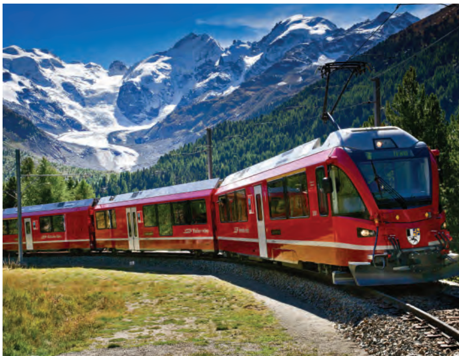
Montebello Curve, Bernina Express

This grand tour of Switzerland encompasses all the highlights of this diverse country. Travel past stunning mountainscapes, sublime lakes, and creaking glaciers on iconic railway lines; stop off in unique, enchanting lakeside cities; and spend cosy evenings in quaint, chocolate-box villages beneath imposing mountains such as the Matterhorn.